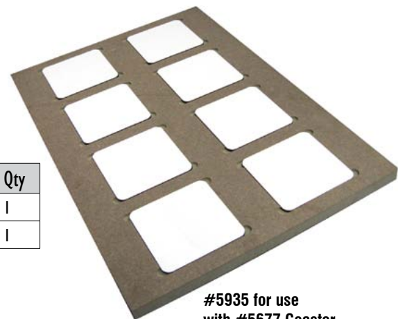
#5935 for use with #5677 Coaster

e = denotes an item is only available in the European warehouse