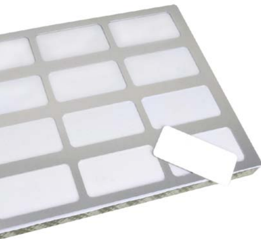
#4091 for use with #5786 Name Badge