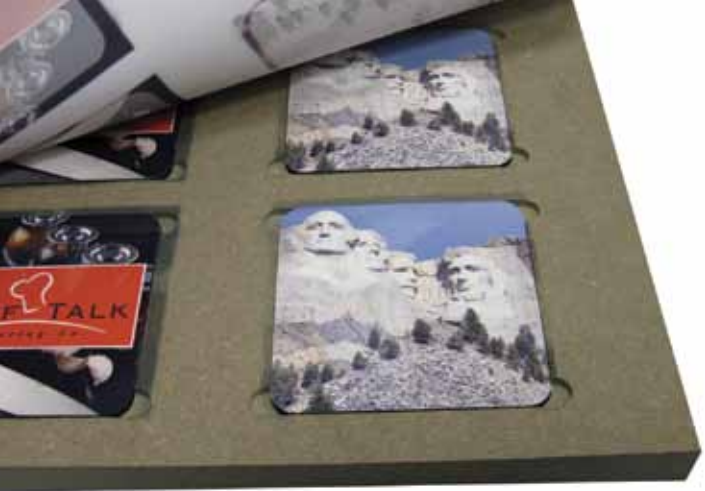
#5935 for use with #5677 Coaster (shown above and below)