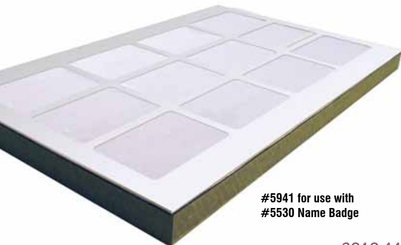
#5941 for use with #5530 Name Badge