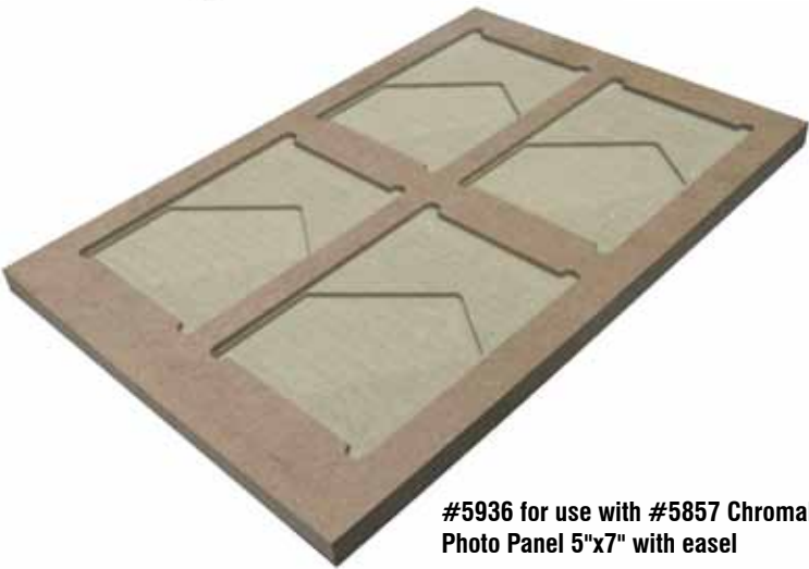
#5936 for use with #5857 ChromaLuxe Photo Panel 5"x7" with easel