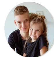
#5522 FRP Magnet, Round