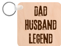
#4799 Natural Wood Key Chain, Square