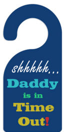
#5545 FRP Door Hanger