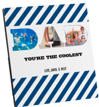
#4836 Hardboard Textured Photo Panel Kickstand, 6"x6" Square

With sublimation, full color designs are beautifully displayed and won't scratch or fade over time.