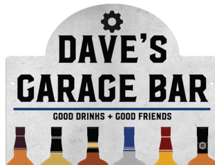
#4795 Metal Outdoor Building Sign, Decorative