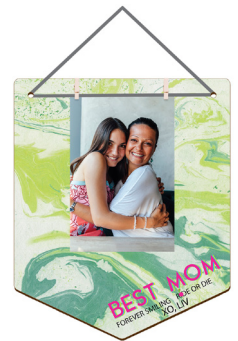
#4847 Hardboard Hanging Sign, Banner Shape

With sublimation, full color designs are beautifully displayed and won't scratch or fade over time.