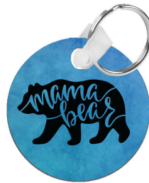
#5521 FRP Key Chain, Round