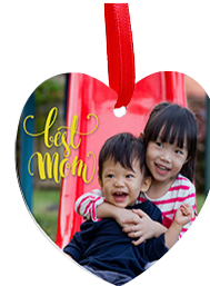
#4332 Metal Ornament, Heart Shape